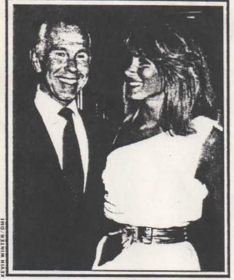
Carson and the future No. 4: She was beached at Malibu